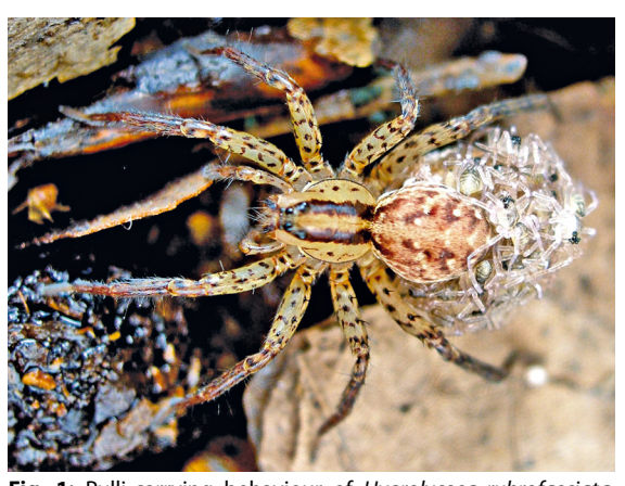
Fig. 1: Pulli-carrying behaviour of Hygrolycosa rubrofasciata . Newly emerged spiderlings occupy the surface of the cocoon instead of climbing onto the opisthosoma of their mother.

All females (of both H. rubrofasciata and P. amentata ) accepted, sooner or later, cocoons of the other species. After emergence, spiderlings of H. rubrofasciata did not try to climb on the opisthosomas of P. amentata females and remained on the cocoon surface (Fig. 2). By contrast, spiderlings of P. amentata tried to climb