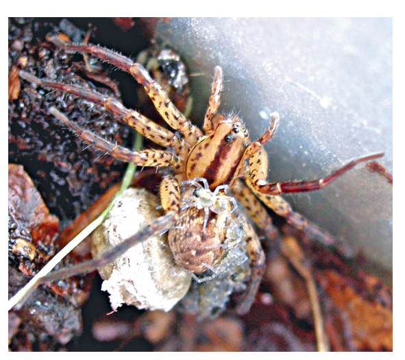
Fig. 3: Behaviour of Pardosa amentata spiderlings on substitute Hygrolycosa rubrofasciata mother. Most of the spiderlings were not successful in settling on the opisthosoma of a substitute female. Instead, they formed a cluster beside the empty cocoon. The female was carrying both the spiderling cluster and the empty cocoon for a while, until she lost the cluster.

A generally accepted statement that females of all wolf spiders carry spiderlings on their opisthosomas was contested. Fujii (1976) was the first author to report "abnormal" behaviour in two Arctosa species which carried spiderlings on their cocoons instead of on their opisthosomas. Suwa (in litt. 1977) and Yaginuma (1991) reported similar behaviour for Hygrolycosa umidicola , and Kronestedt (1984) and Ahtiainen et al. (2002) suggested such a possibility in Hygrolycosa rubrofasciata too, In the present study, it was confirmed unequivocally that females of H. rubrofasciata do not carry spiderlings on their opisthosomas, but instead on their empty cocoons. Until now, this