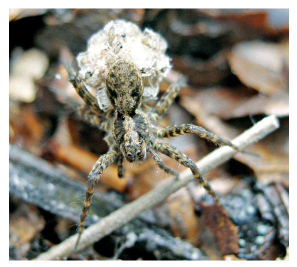
Fig. 2: Behaviour of Hygrolycosa rubrofasciata spiderlings on a substitute Pardosa amentata mother. The spiderlings remained on the cocoon surface and did not try to climb onto the female's opisthosoma.

onto the opisthosoma of H. rubrofasciata females, yet only few spiderlings were successful in settling on a substitute mother. The majority of spiderlings formed a cluster either beside the empty cocoon or on the ventral surface of the female's opisthosoma – in the area where the cocoon was touching the opisthosoma. Therefore, H. rubrofasciata females were carrying two 'pellets': the empty cocoon and the cluster of P. amentata spiderlings (Fig. 3). However, the females lost the clusters within the same day as the spiderlings emerged and the spiderlings dispersed the following day. Examination of the cocoon surfaces revealed no differences between the cocoon structures of both species (Figs 4, 5).