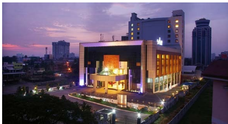
Gokulam Park Hotel & Convention Centre

The congress will take place at the Gokulam Park Hotel and Convention Centre, located in the heart of Kochi. This modern venue offers state-of-the-art conference facilities, spacious meeting halls, high-speed connectivity, and comfortable accommodation. Its central location ensures convenient access to major transport hubs, city landmarks, and cultural attractions. The venue has successfully hosted numerous international conferences, ensuring smooth logistics and a professional environment. Delegates can look forward to a seamless blend of academic engagement and warm Kerala hospitality.