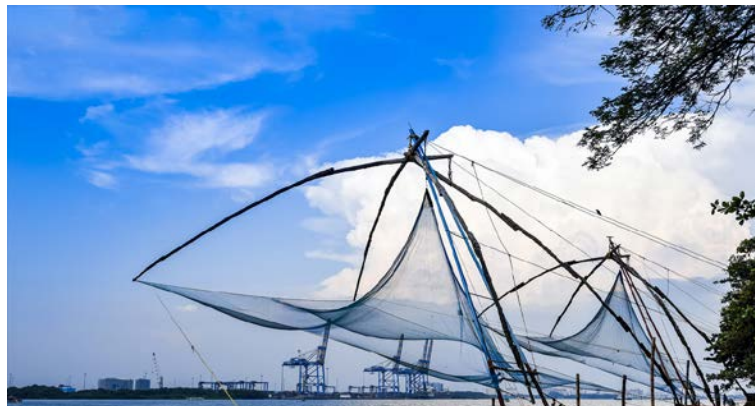
Iconic Chinese fishing nets against the Kochi skyline

Kochi is situated in the state of Kerala — internationally celebrated as God's Own Country — a land of unmatched natural beauty, ranked among TIME Magazine's 50 Greatest Places and featured by National Geographic and the New York Times . With tranquil backwaters, lush rainforests, tea plantations, pristine beaches, spectacular waterfalls, and rich biodiversity, Kerala offers visitors a unique combination of natural wonders and cultural traditions. Delegates will also have opportunities to experience Kerala's world-famous Ayurveda, cuisine, and classical performing arts.