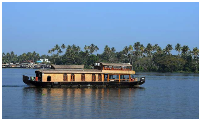
Houseboat - A floating retreat through Kerala's iconic waterways