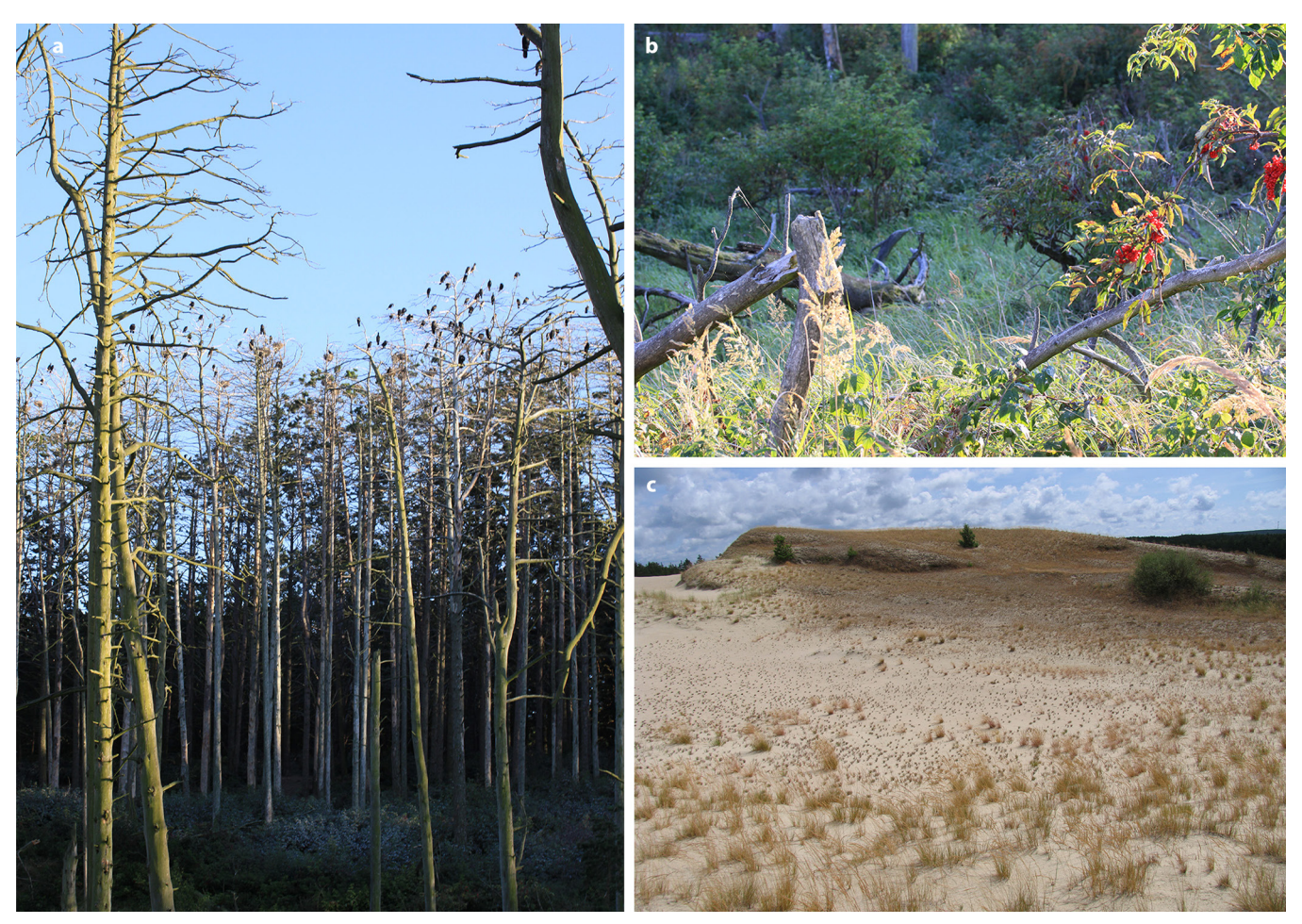
Fig. 2: Sampling sites. a. Great cormorant colony in the old forest; b. the old part of the cormorant colony in the old forest; c. white sand dune with Leymus arenarius

mentioned, newly established colony of Great cormorants, and to provide a summary of the species known from this valuable, protected area.