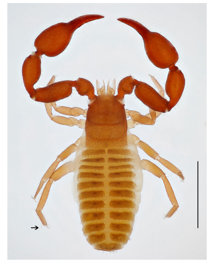
Fig. 3: Dinocheirus panzeri, male. Arrow indicates the pseudotactile seta on the tarsus of leg IV. Scale line: 1 mm

Remarks. Dinocheirus panzeri is newly recorded here from Lithuania. The species is widespread in Europe with records also from Azerbaijan, Iran and Turkey (WPC 2022). Beier (1963) and Drogla & Lippold (2004) recorded its presence in various habitats, such as tree hollows, under tree bark, in bird nests, litter of coniferous and deciduous forests, manure heaps and from farm buildings. Beier (1929) observed the presence of D. panzeri in an ant nest in Austria and Lohmander (1939) published a record from beehives in Sweden. Rafalski (1967) found the species in mammal burrows in Poland. The presence inside farm buildings, chicken houses and pigeon lofts was recorded mostly in the northern areas of the species range (Lohmander 1939, Legg & Jones 1988) while in Central Europe, the majority of D. panzeri findings concerned tree hollows (Šťáhlavský 2001, Krajčovičová & Christophoryová 2014, Christophoryová et al. 2017). Dur-