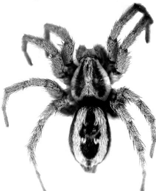
Fig. 1: General habitus of female of Cesonia aspida Chatzaki, 2002.

Material examined. TURKEY: (1♂, 1♀) (NUAM), Osmaniye Province, Yarpuz valley (37° 03'N, 36° 25'E),