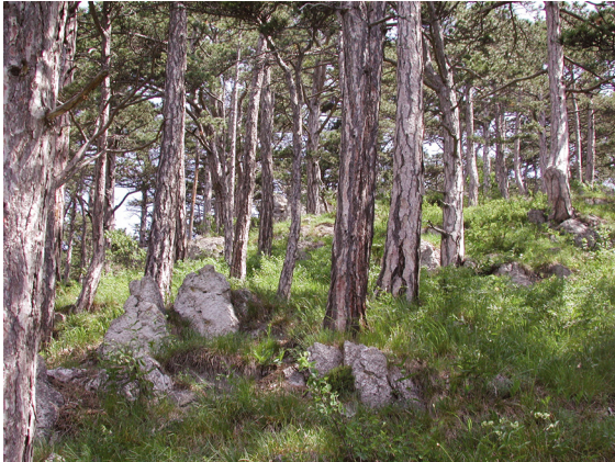
Fig. 1: Locality “Merkenstein-Schöpfeben”, an Austrian pine forest, where Sauron rayi was found in the year 2004. – Photo by Alexander Pernstich, taken on 8 June 2004.

tion maps for this species are available for Germany (Staudt 2014, five records) and Slovakia (Gajdoš et al. 1999, 14 records).