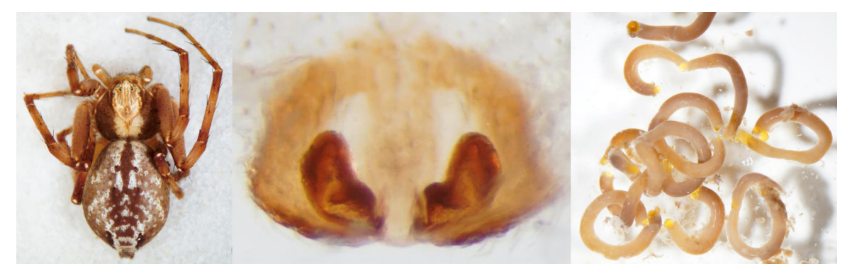
Fig. 2: Parasitized Philodromus female (left), collected in the Allgäu region, Bavaria, Germany, in August 2012. Its epigyne (centre, dorsal view) lacks receptacula and a fully developed median septum, just as seen in P. depriesteri , and during the genital preparation a parasitic worm (right) about 10 cm in length was detected.

This species, a member of the Philodromus aureolus group, was first described from two widely separated localities (Krimml, Austria, and Geisenheim, Germany), separated by 600 km including the German Alps. Nonetheless, despite its presumably extensive range and much increased collecting activities in the last decades, the species has never been found again since its description 50 years ago. The reason is probably that the two female types preserved in the Senckenberg Museum Frankfurt are malformed (or subadult) specimens with incompletely developed epigynes (Jäger pers. comm.). Vulval structures very similar to those of P. depriesteri were observed in a female Philodromus of the aureolus group that turned out to be infected by a parasitic worm (Mermithidae or Nematomorpha; Fig. 2). This specimen was collected by beating the field layer of a wet meadow, together with typical specimens of Philodromus collinus . It therefore seems very likely that the unusual genitalia are the result of a parasite-induced malformation, comparable to the case of Lepthyphantes beckeri . Nematode infections have been repeatedly described in spiders (Meyer 2014 and references therein), and