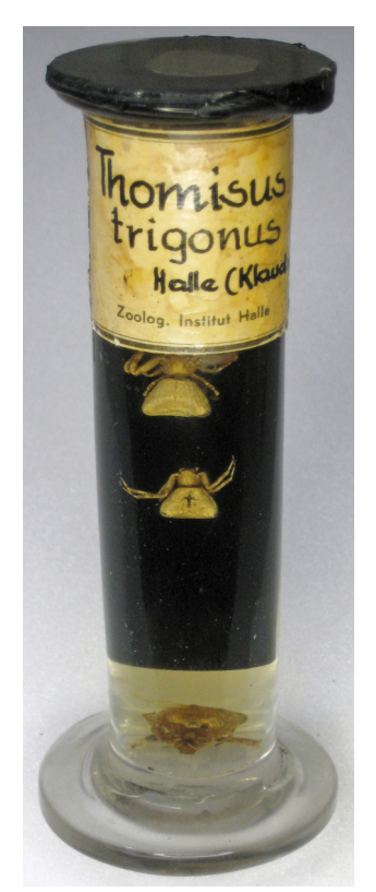
Fig. 4: Specimens of Thomisus trigonus in Giebel's collection in Halle, possibly including the original type

Possible type material of this species is still preserved in Giebel's collection in the Zoological Collections of the Martin Luther University Halle, Germany. The vial with the material contains three specimens of P. truncatus (Schneider pers. comm.; Fig. 4), the species that was already considered as closely related in the original description (Giebel 1869: 367-368), which was based on a single female close to oviposition.