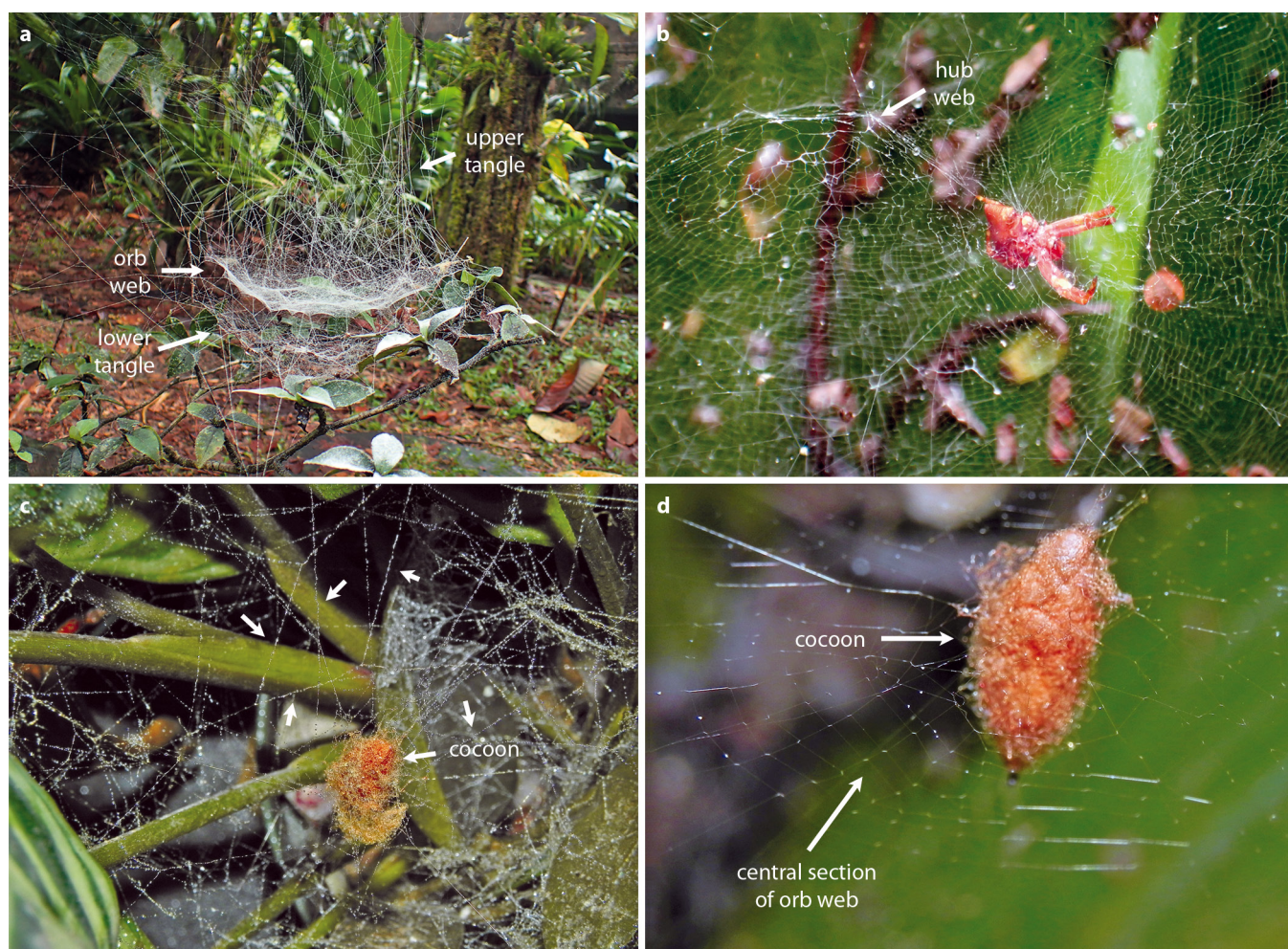
Fig. 1: Distinct aspects of the web of Kapogea cyrtophoroides . a. Natural web in the forest (the web in the picture is similar to at least other 20 webs we have seen in the field). b. The hub of a natural web. c. Cocoon web that the larva induced the spider to build after the spider was removed from its web; arrows point to cocoon web threads. d. Central section of the cocoon web and the wasp's cocoon

to 26.0 °C and the mean annual precipitation from 3500 to 4500 mm at these sites (Martínez 2012, Tirimbina Biological Reserve 2010). Spiders and their hosts were collected in mature and old second growth lowland rainforests.