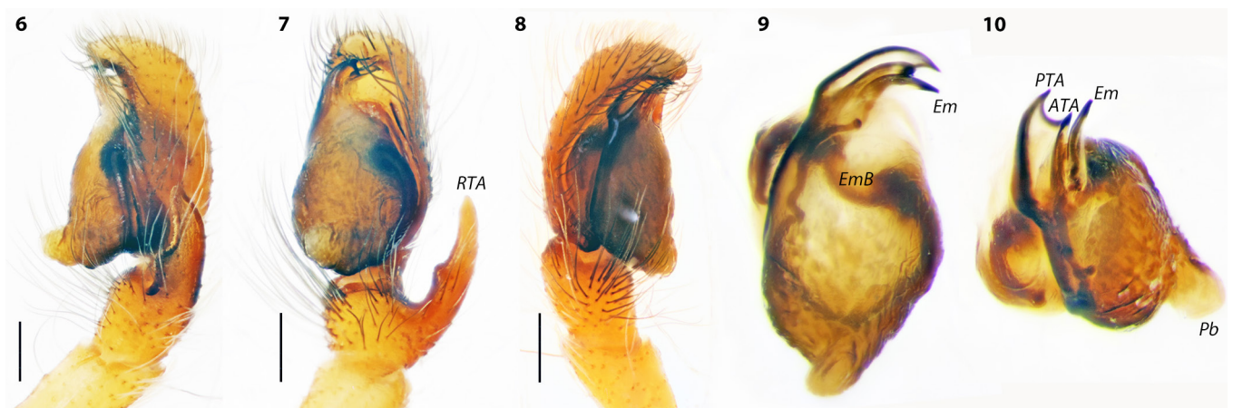
Figs 6-10: Copulatory organs of holotype (6-8) and paratype (MMUE) (9-10) male Salticus lucasi sp. nov. Palp in 6. retrolateral; 7. ventral; 8. prolateral views. Bulb after expansion in KOH in 9. ventral; 10. apical views. Abbreviations: ATA anterior blade of terminal apophysis; Em embolus; EmB embolic base; PTA posterior blade of terminal apophysis; RTA retrolateral tibial apophysis. Scale bars: 0.2 mm