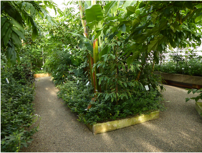
Fig. 1: Collecting site of Eukoenenia florenciae in the tropical economic plants house (house 2) of the Munich Botanical Garden

7871 (18S) and MT827873–75 (28S). Terminology of setae follows Christian & Christophoryová (2013).