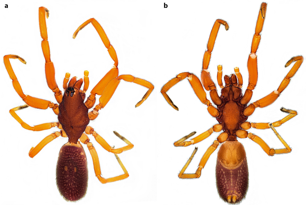
Fig. 1: Stenochilus hobsoni , male habitus, a. dorsal view, b. ventral view

mily) extends the range of the species 3000 km to the west (Fig. 3).