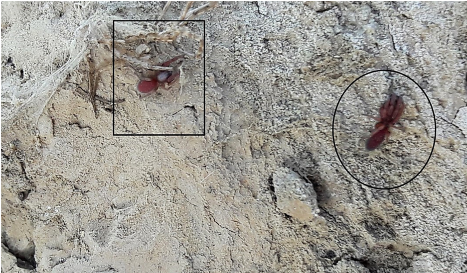
Fig. 4: Live specimens within the habitat: S. hobsoni (circle) and Palpimanus sp. (square)