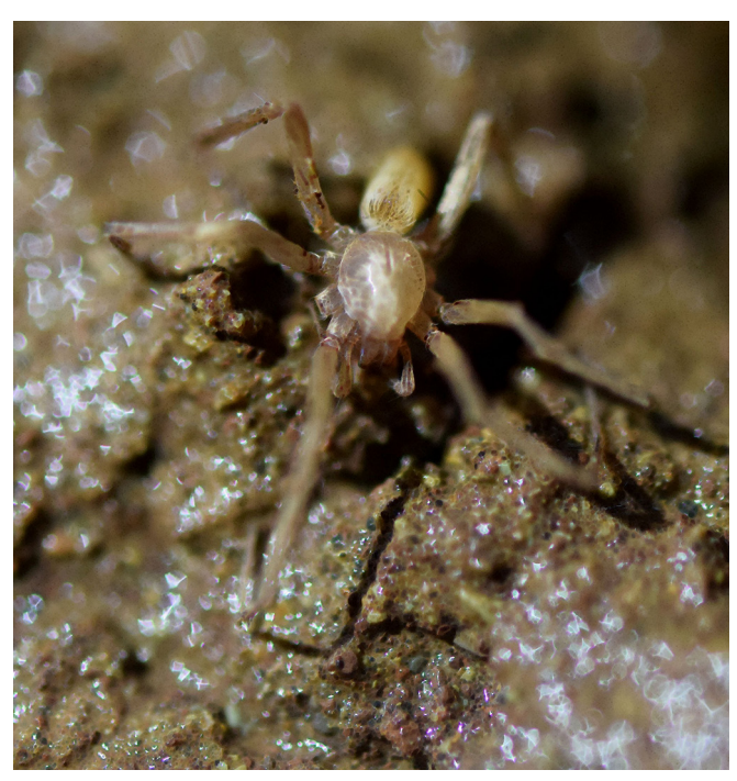
Fig. 1: Agraecina agadirensis, male (Morocco, Tizgui, Imi Ougoug, Ifri Ouado cave)

Description of the male of Agraecina agadirensis Lecigne, Lips, Moutaouakil & Oger, 2020 (Figs 1, 2a-h, 3a-c) Agraecina agadirensis Lecigne et al. 2020: p.13, figs 1a, 4a-h, 5a-b (descr. female)