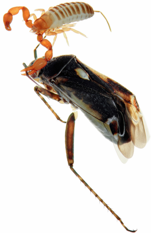
Fig. 1: Lamprochernes nodosus attached to the antenna of Polymerus unifasciatus from Slovakia

29. Apr. 2018: One female of C. habnii was attached to Brachyopa bicolor (Fallén, 1817) (Diptera, Syrphidae; det. H. Heimbürg). Specimens were individually collected in an alluvial forest near the locality of Schönau an der Donau (48.13917°N, 16.61444°E; 150 m a.s.l.; leg. H. Heimbürg).