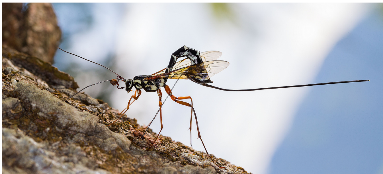
Fig. 3: Dendrochernes cyrneus attached to the antenna of Rhyssa persuasoria from Austria