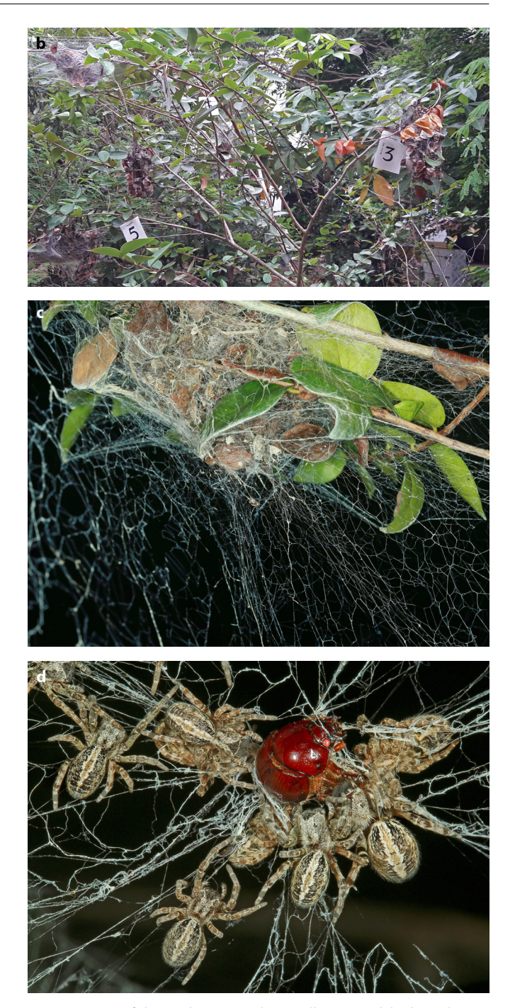
Fig. 1: a. Map of the study area at Christ College, Irinjalakuda (red spots = social spider web colonies); b. distribution of colony in Eugenia uniflora; c. an individual colony of S. sarasinorum; d. immobilization of the prey

branches, prey remnants and also their own exuviae into the silk nest. The site identified for the study was on the Christ College campus (10.350°N, 76.200°E, 12 m a.s.l., Fig.1a), located in the town of Irinjalakuda in the Thrissur district in Kerala. The study was undertaken during the period of June-September 2017. The observations were made in the field (Fig. 1b-d).